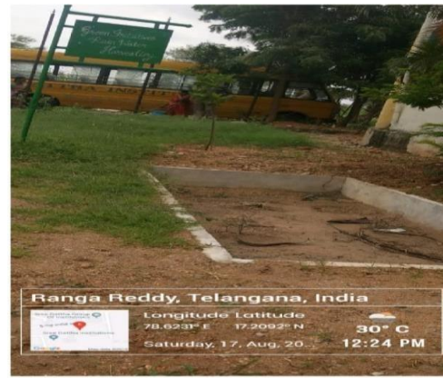
Rain water harvesting